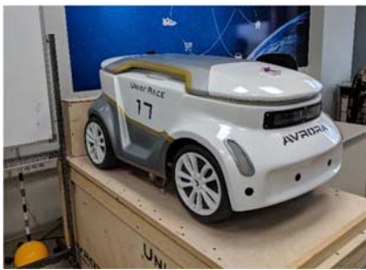
Fig. 1. Avrora Unior robot.