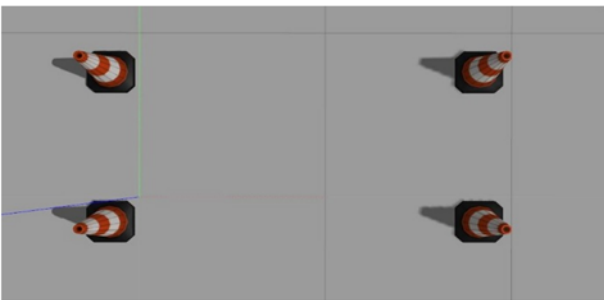
Fig. 7. Parking space in Gazebo

Gazebo simulation with experiment configuration was created (Fig. 7). Validation of our implementation was made by checking trajectories followed when the robot passes through key points to a goal point. Avroa Unior robot model successfully went through all points although its trajectories were not perfect (Fig. 3). Errors were related to an imperfect stopping process. Average displacement with regard to OX axle was about 0.06 m and with regard to OY axle was about 0.013 m relatively to the goal point; the displacements were estimated in series of experiments.