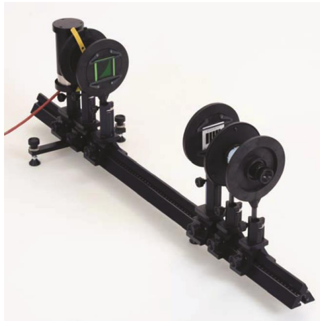
Fig.1. Experimental setup