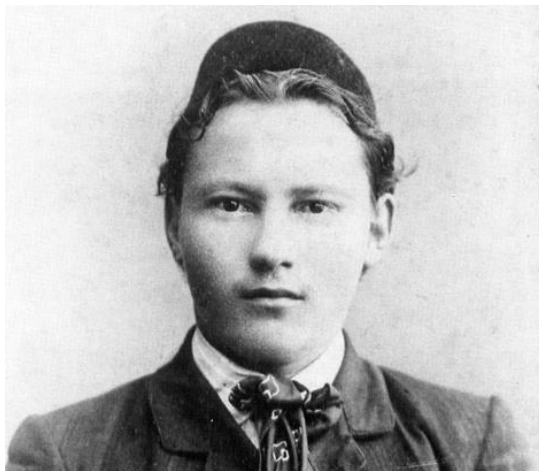
Gabdulla Tukay Higher School of National Culture and Education