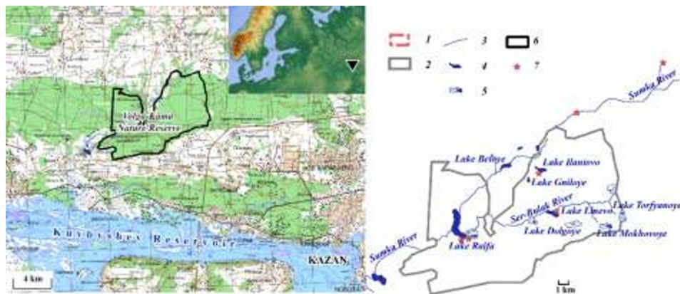
Fig. 1. Scheme of a trial plot to determine the influence of beaver on near-river floodplain vegetation. — round plot with radius R=17,84 m; — "inland transects" ( 3\text{ m}\times 7\text{ m} ), — "bank transects" ( 3\text{ m}\times 7\text{ m} ), — test plots ( 1\text{ m}\times 1\text{ m} ); — starting point with notation sign.