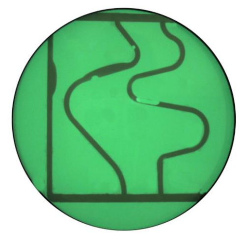
Fig. 1: Picture of a model blood vessel with a contrast medium on a fluorescent screen, taken with a digital camera.

This experiment investigates the effect of a contrast medium on the absorption of X-rays. Because for the model of blood vessels described here the contrast medium only flows through plastic tubes and between plastic plates, a simple and cheap iodine compound such potassium iodide can be used instead of the tri-substituted aromatic iodine compounds used with people.