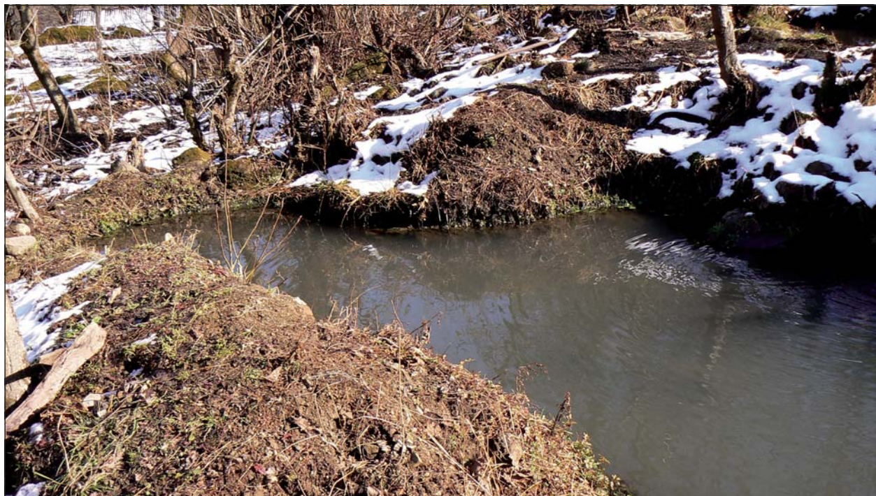
Fig. 3. The breeding site of the Hyrcanian frog in Sym village (Astara District, Azerbaijan).

tion process, destruction of the first LAGs is possible. To ensure accuracy of age determination it is necessary to analyze the rate of resorption (Smirina, 1989).