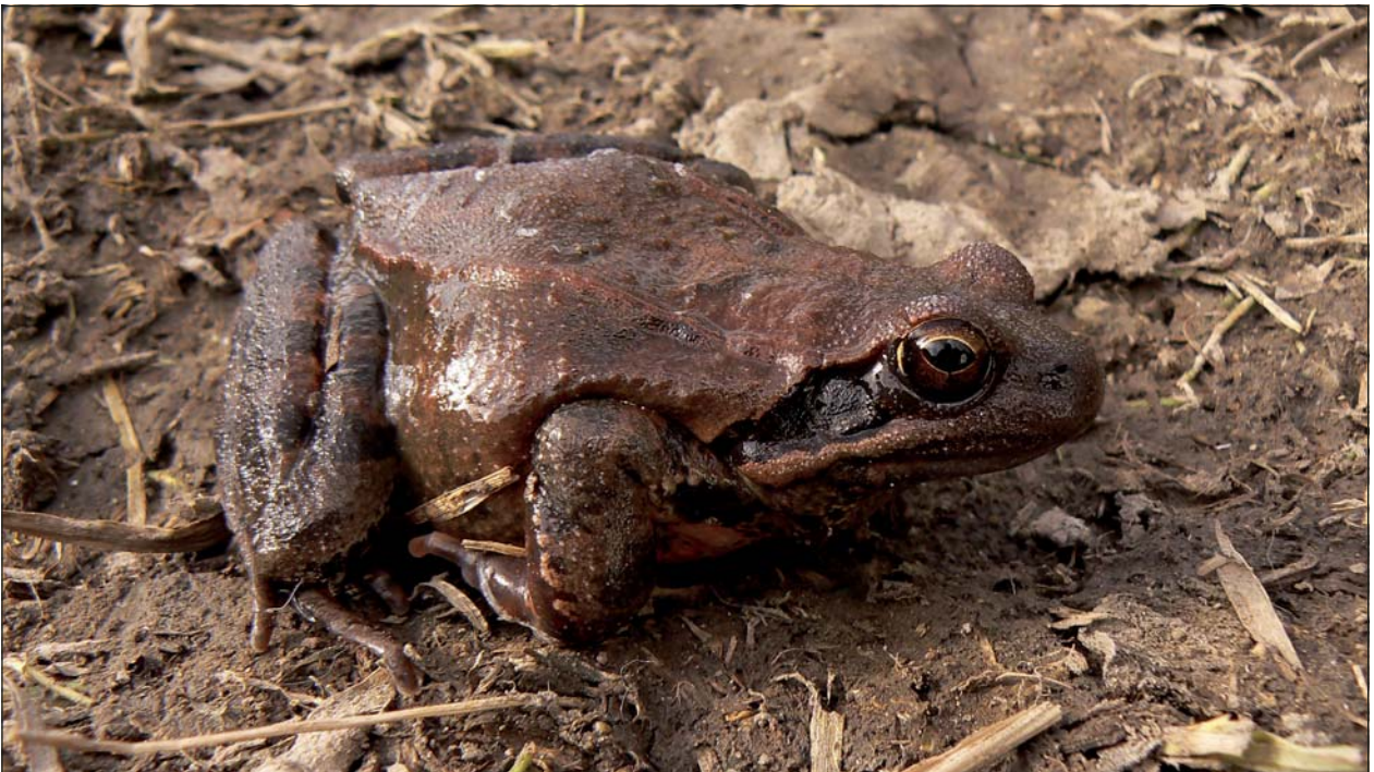
Fig. 2. Adult male of the Hyrcanian frog from Sym village (Astara District, Azerbaijan).

The rate of endosteal resorption varies in different species and during life of individual. After start of sexual maturity, in connection with overall decreasing of growth the processes of resorption decrease or stop. Therefore, adhesion lines, which are not resorbed after start of sexual maturity and formed after it, evidently persist throughout a life of animal. After that, the rate of resorption decreases and almost stops. As a result of the resorp-