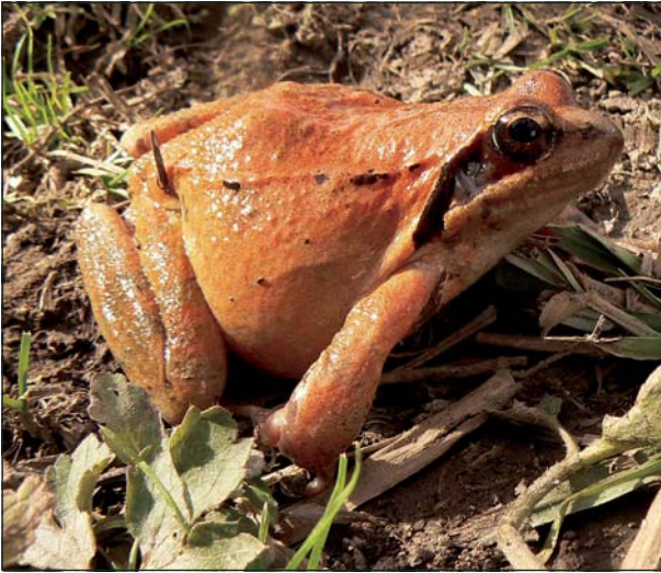
Fig. 1. Adult female of the Hyrcanian frog from Sym village (Astara District, Azerbaijan).

Azerbaijan (38°29' N 48°38' E, 480 m a.s.l.; Fig. 3). The body length ( L ) was measured by a standard method (Bannikov et al., 1977) using a caliper with an error of 0.1 mm. Afterwards, the proximal phalanges of the third digit of the right hind limb was clipped. Used frogs were kept in artificial conditions for 3 – 5 days and after this