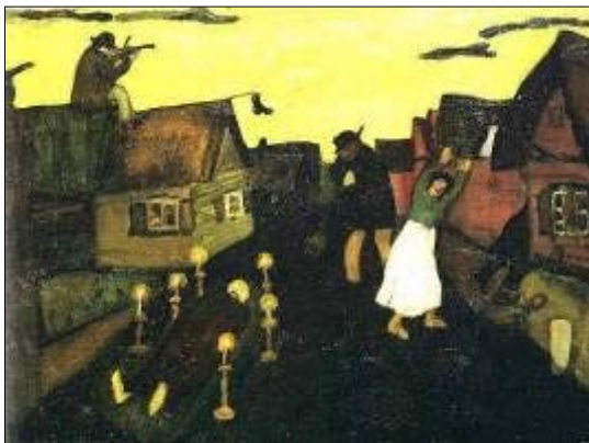
Fig. 31. The Departed (Death) , 1908. Oil on canvas, Paris, National Centre of Art and Culture, Named by George Pompidu

Chagall's musicians are direct participants (eyewitnesses) of epochal historical events. Thus, in the picture Revolution ( fig. 17 ), the ensemble placed in the top right corner personifies an independent witness of change in the social-political coordinates of the state, regarding the event from outside. 34 Busy with their peaceful labour of performing, the musicians withstand the acerbic armed battles of humanity, thus affirming the inviolability of creative activity under any regime.