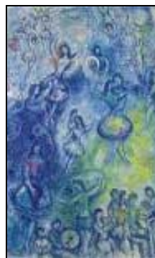
Fig. 33. Dance , 1967. Oil on canvas, 129/ 80 cm.