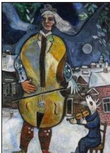
Fig. 15. A Violinist , 1939. Oil on canvas, 100/73 cm. Private collection

The person-cello is one of Chagall's stable images which migrate from work to work. We see variations of it in the etching A Musician (fig. 16); in the paintings Music (fig. 40), Concert (fig. 39) and Revolution (fig. 17); in the painting of the dome lamp of the Parisian opera, where it is endowed with wings; and in other works.