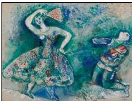
Fig. 32. Dance , 1928. Paper, aquarelle, 50.5/65.7 cm. Private collection

Frequently in Chagall's pictures, musical-sound associations appear by means of conveying plasticity of movement, through dance ( Dance , fig. 32-33 ), demonstration ( In the Motion [Martial Music] , fig. 34 ) or acrobatic feats ( Red Horse , fig. 35 ). These pictures are saturated with a sense of procedure, rhythm and time more characteristic of music than fine art.