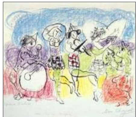
Fig. 37. The Circus Musicians , 1965. Lithography. Private collection

In Chagall's circus works, which reconstruct the world, as "a festival, dream, flight of imagination, where there is no place for melancholy and greyness," 36 musical fragments receive more effective orchestration and brighter dynamics. The collective performance is dominant; alongside