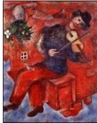
Fig. 4. A Violinist and an Inverted World , 1929