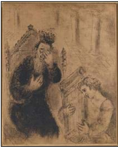
Fig. 20. David sings, accompanying himself with the harp before Saul, and relieves his sufferings (The First Book of Samuel, XVI, 19-23), 1956. Paper, etching, 30.7/24.8 cm. Nice, National Museum of Marc Chagall

The idea of being consoled by music in hardships and grief is presented in the picture Loneliness . Although the melody does not “sound” here formally, the violin in the centre of composition testifies to the curative influence of musical art on the human soul.