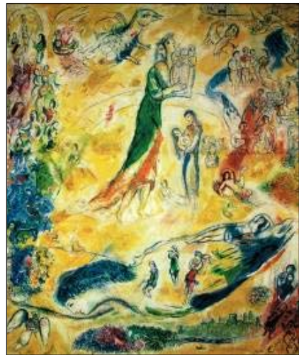
Fig. 42. The Sources of Music , 1966. Panel, 9/11 m. New York, the Metropolitan

Musical images come to life in two panels created much later - in 1966 - for the lobby of the Metropolitan in New York, the city which sheltered Chagall during the Second World War. Forming a diptych, The Sources of Music ( fig. 42 ) and Triumph of Music ( fig. 43 ) contrast in colour: the first canvas is made in blue-green colours against an ochreous background, while the second presents the idea of triumph in a passionately pulsating red palette. The panels present scenes from well-known musical dramas The Firebird by Igor Stravinsky, The Magic Flute by Wolfgang Amadeus Mozart and Carmen by Georges Bizet. In the centre of each work, surrounded by abundant depictions of violin, cello, mandolin, aulos (double flute) and shofar, appear mythological and Biblical figures with musical instruments: a bifacial,