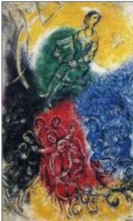
Fig. 40. Music , 1962-1963. Oil on canvas. Private collection