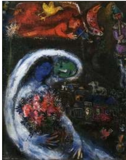
Fig. 7. A Bride with Blue Face , 1932. Oil on canvas, 100 x 81 cm. Private collection

Levitating on high ( A Bride with Blue Face , fig. 7 ) or floating in the air, as if jumping ( A Painter and His Bride ), violinists wrap the enamoured lovers with tender musical covers, “repeating” their harmonic relations and motifs, “joining” two halves - male and female - into a single unity. The semantics of musicians’ flight in Chagall’s art is connected with the ability of art to endow the feeling of freedom, delight and happiness, to direct us towards beauty and reveal the angelical, the divine in a person.