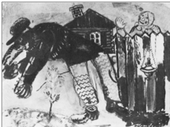
Fig. 10. A Violinist , 1926-1927. Paper, gouache, 49/64 cm. Private collection