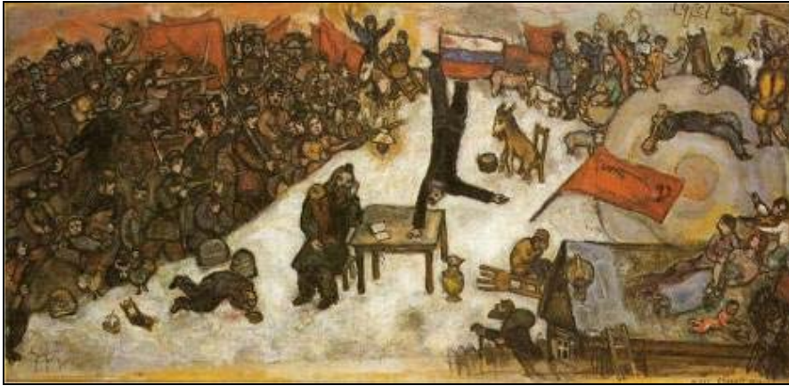
Fig. 17. Revolution , 1937. Oil on canvas, 50/100 cm. Private collection

pressing the strings with his fingers, pointing at the conventional, symbolic character of representation of the instrument.