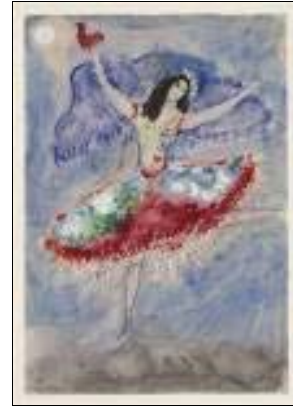
Fig. 48. A sketch for Zemfira's costume for the first scene of "Aleko" ballet, 1942. Paper, gouache, watercolours, pencil, 53.3/36.8 cm. Private collection

The significant proportion of works by Russian composers depicted can be explained by indelible impression left on Paris audiences by Diaghilev's Ballets Russes at the beginning of the 20 th century. The selection of works was also influenced by Chagall's own artistic involvement in developing decorative elements of ballets such as Pyotr Tchaikovsky's Aleko (based on Pushkin's poem The Gypsies ) for piano trio, performed by Leonid Myasin (1942); Stravinsky's Firebird with choreography by Michel Fokine (1945), revisited by Adolph Bolm and later staged by George Balanchin (1950); and Ravel's Daphnis and Chloe , based on a libretto by Michel Fokine, with choreography by George Skibin (1959).