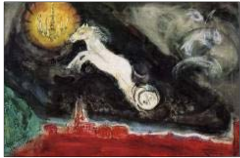
Fig. 46. Fantasy of St. Petersburg . A scenery design for the conclusion of the ballet Aleko . 1942. Paper, gouache, watercolors, pencil, 38/57.1 cm. New York, Museum of Modern Art

Theatrical performances, the majority of which have a tragic conclusion, lose their tragic pathos at Chagall's whim. The painter depicts not the intensity of emotions, the fatal course of circumstances, the fight for depth and feeling, but an ideal world where the heroes can live tranquilly and happily in the absence of irreconcilable contradictions. The musical-dramatic personages, pairs of lovers, angels, animals, and birds, musical instruments coexist in the brightly-mottled space of the dome lamp. The painter himself is also present with his palette and brushes, observing the audience from the top. Chagall's universe expresses the ideas of fraternal affection and mutual understanding through music, in artistic language that is clear and plain to everyone. 46 The dome painting, taken as a whole, sheds light and optimism, inspiring visitors to the Opera with the sharp thirst of life.