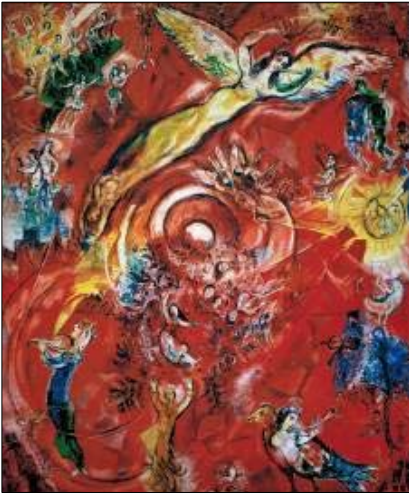
Fig. 43. Triumph of Music , 1966. Panel, 9/11 m. New York, the Metropolitan

crowned David-Solomon 40 with a harp in Sources and the winged goddess Nike in Triumph , announcing the victory of music with trumpet exclamations. While creating the panel, Chagall worked with the outstanding Russian ballet-dancer Maia Plisetskaya. Through free improvisation to Felix Mendelsohn's violin concerto, performed by Yehudi Menuhin, she demonstrated for Chagall the main poses and motions of classical dance, which the painter immediately recorded in his sketches. 41