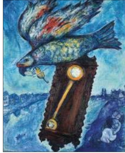
Fig. 13. Time is a River without Shores 1930-1939. Oil on canvas, 40.5/32.3 cm. New York, The Museum of Contemporary Art

A goat with thrust-out chest, wearing a two-piece outfit on whose shoulder a small woman with flowers has made herself comfortable, is ready to touch the strings of his green violin ( Spring , fig. 14 ). As with the fish ( fig. 13 ) one of his hands is human, while the other is represented as a bifurcated hoof. Thus, music is interpreted as a guide between the earthy and high-minded, low and high, real and imaginary. It erases the boundaries between the world of people and animals, destroys the barriers, appeals to consensus and unity.