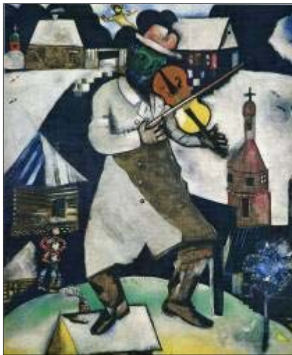
Fig. 1. A Violinist , 1912-1913. Oil on canvas, 188/158 cm. Amsterdam, Stedelijk

The colour of not only the violinist's face, but also his clothes, instrument and interior elements are of great symbolic importance, as well as the background selected by the painter. Non-standard, sometimes shocking combinations, aimed at revelation of ingenuity, the "distance" of the performed set the "key-note" of the whole picture, bear aesthetical information to the viewers. A paradigmatic example is the above-mentioned green violinist who Chagall depicts several times: in A Violinist (1912-1913, fig. 1 ), on the panel Music for the State Jewish Chamber Theatre and in Green Violinist (1923-1924, fig. 2 ), duplicating the successfully-rendered image of the panel. A violinist in the picture Juggler , found in the lithography The Musicians against a Green Background , is depicted against a green background, which to Chagall means joy, welfare and love for life.