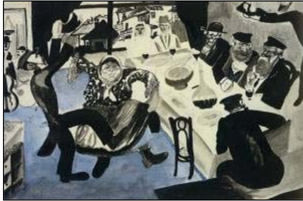
Fig. 30. Jewish Wedding , 1912. Paper, ink, 20.5/30 cm. Private collection

These scenes of everyday life are interesting from the viewpoint of Chagall's reflection of the psychological characteristics, mood and behaviour of various personages. The Russian wedding procession involves emotional states such as the bride's quiver of expectation, the peaceful sorrow of the father, the curiosity of children and run-down passers-by, the joy of the woman following the bride (possibly her mother or kinswoman) and the excitement of the man who has taken alarm in the background.