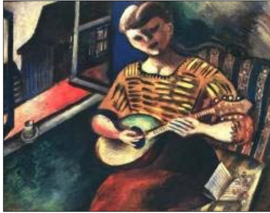
Fig. 18. Lisa with Mandolin , 1914. Oil on cardboard. Private collection

evidenced by half-closed eyes and the smile wandering across his face (fig. 19).