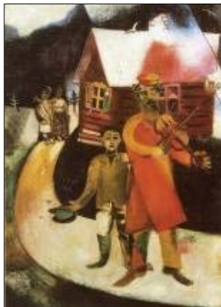
Fig. 5. A Street Violinist , 1911-1914. Oil on canvas, 94.5/69.5 cm. Dusseldorf, North Rhine-Westphalian Art Collection