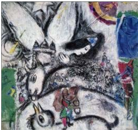
Fig. 8. Circus Maximus , 1968. Oil on canvas, 169.7/160 cm. Private collection

her hand in an indignant gesture. The drunken step of the woe-begotten performer lacks secure footing - his leg, raised for stepping, threatens complete loss of balance. One moment more and the sot will be on the ground, yet even in this precarious moment, he keeps hold of the violin, continuing his endless play-acting. This work is interesting both from the viewpoint of depicting a “pre-zero-gravity state,” and the musician’s appearance, endued with a beast-like face and powerful paws at the painter’s pleasure. Possibly, it is a metaphor for the unenviable state of the drunkard, gradually losing human features and grasping the violin as his only source of salvation.