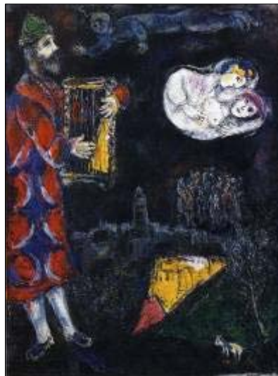
Fig. 22. King David's Tower , 1968-1971. Oil on canvas, 117/90 cm. Nice, National Museum of Marc Chagall

King Solomon is also never parted from the harp (kinnor), praising the mighty power of love. In the series The Song of Songs , Solomon's strains, "accompanying" the embraces of lovers, straightforwardly express sensorially ecstatic feelings, showing considerable alignment with the wedding ceremony scenes that often occur in Chagall's canvases. It is not without cause that the canonical Testament story is interpreted not only as tale of the love borne by Solomon for the girl Shulamite, but also as a collection of hymeneal songs, reproducing the structure of a wedding rite. The use of bright, warm, inviting colours with erotic hidden motifs is typical of Chagall's works in The Song of Songs (fig. 23) series.