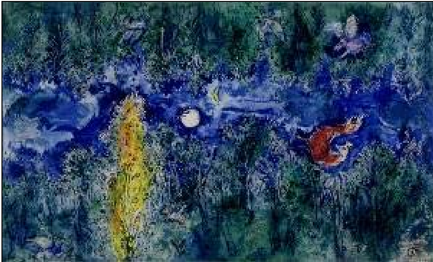
Fig. 49. The Firebird in the Enchanted Forest. A sketch of curtain for the Firebird ballet by I. Stravinsky, 1945. Paper, watercolour. Private collection

In last years, Chagall developed an interest in stained glass art, into which he also implemented musical plots. In his stained glass composition American Windows , which consists of six parts and was created for the Art Institute of Chicago, commissioned by the City Hall for the USA bicentenary, reminiscences of his early works appear.