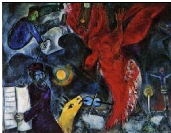
Fig. 11. The Angel's Fall , 1923-1947. Oil on canvas, 148/189 cm. Private collection