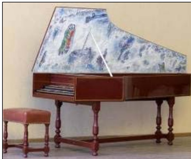
Fig. 26. The Meeting of Isaac and Rebecca . Harpsichord's cover painting, 1980, 95/299 cm. Nice, National Museum of Marc Chagall