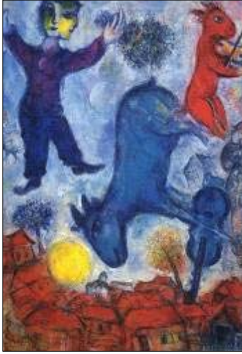
Fig. 12. The Cows above Vitebsk , 1966. Oil on canvas, 116/89 cm. Private collection