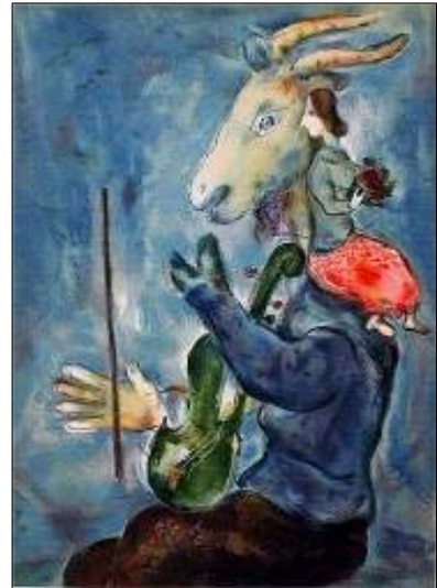
Fig. 14. Spring , 1938. Lithography, 35/26 cm.

One of the most capacious of Chagall's pictures, demonstrating a thesis about the unity of all living things, is A Violinist ( fig. 15 ). It depicts a musician, full of inspiration, playing a cello which is represented as his own body. 26 In this way, Chagall underlines the continuity between the artist's fate and his talent, the inseparability of the musician's