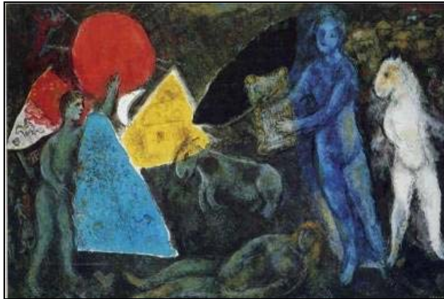
Fig. 25. The Myth of Orpheus , 1977. Oil on canvas, 97/146 cm. Private collection

colouring of the action, conveying sacrament of the wedding rite, and the deep excitement caused by the event. The music played at the moment when the souls of the enamoured come into contact with each other in Chagall's works, is suffused with a special spirituality, irrespective of whether a lonely violinist plays the motif, or a heavenly orchestra rewards the newly-married couple with a Hosanna ( fig. 28 ). It is necessary note that during the Jewish wedding under the Chuppah (in the picture Wedding , fig. 27 , its function is fulfilled by red angel's wings), the lovers are deprived of any passion and tenderness, their faces and poses express a deep concentration.