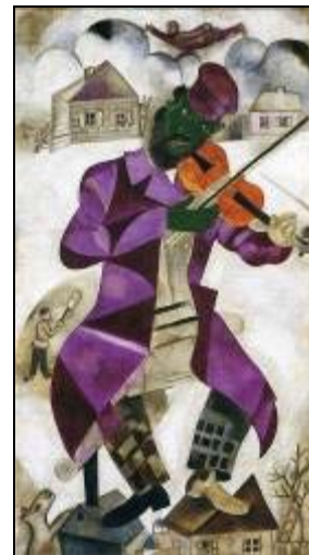
Fig. 2. A Green Violinist , 1923-1924. Oil on canvas, 198/108.6 cm. New York, Solomon R. Guggenheim Museum

The range of Chagall's colour "score" is deeply impressive: faery blue ( Blue Violinist , fig. 3 ), passionate red ( A Violinist and an Inverted World , fig. 4 ), flushed orange ( Street Violinist , fig. 5 ), fervent yellow ( A Violinist and a Cock , fig. 6 ) and depressing black-brown ( The Musicians , 1908).