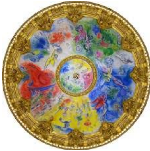
Fig. 44. Dome painting. Paris, Grand Opera

the multi-coloured rush of public far below. I wanted to sing like bird, without the theory, without method.” 42