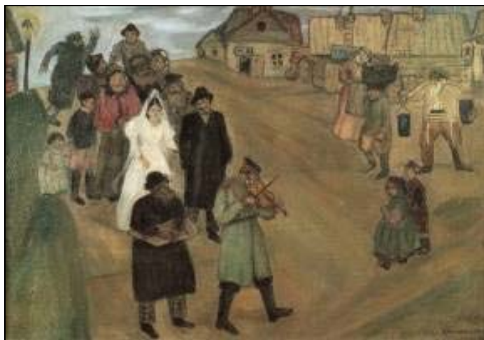
Fig. 29. Russian Wedding , 1909. Oil on canvas, 68/97 cm. Zurich, Collection of Emil Burle's Fund

It is music, through which Chagall tries to understand the peculiarities of wedding rites, which allows the viewer to touch the roots of ethnic culture. He vividly describes a ceremonial Russian wedding procession, headed by a bored military violinist and elderly guslar (poet-singer) ( Russian Wedding , fig. 29 ) and documents a table at Jewish wedding ( Jewish Wedding , fig. 30 ).