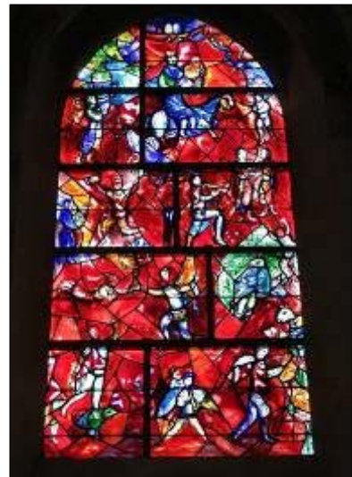
Fig. 52. Stained glass window, 1978. Chichester Cathedral

Glorifying God with a trumpet fanfare, the ascension of a solemn Halleluiab skywards is represented in the stained glass of Chichester Cathedral in England ( fig. 52 ). The narrative is based on lines from psalm 150: "... any breath praises the God." It is one of the most sonorous of Chagall's works, where the sound of shofars, trumpets, violins, keyboards (possibly a small organ), tambourine and cymbals merge in one musical greeting. The image of King Solomon riding a biblical donkey (mule) harp in hand is placed at the top of