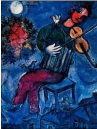
Fig. 3. A Blue Violinist , 1947