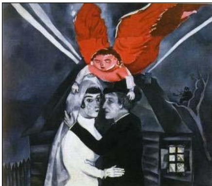
Fig. 27. The Wedding , 1918. Oil on canvas, 100/119 cm. Moscow, The State Tretyakov Gallery