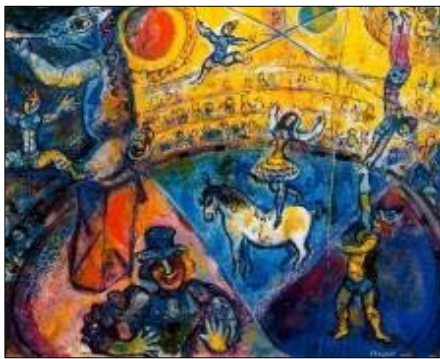
Fig. 36. A Circus Horse , 1964, 49 x 61 cm. Private collection

Olga Klepatskaya distinguishes musicality as a feature of painter's aesthetic vision, analysing the circus images of Marc Chagall in the context of the Russian avant-gard: "Its [musicality] appears in compositional solutions, in the playful whimsicality of colours, in