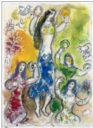
Fig. 24. The Dance of Myriam , 1966. Paper, watercolour, 44.3/32 cm. Nice, National Museum of Marc Chagall

The close entwinement of love and music is native to Chagall's genre of biblical paintings. Music fills the scenes depicting lovers with deep meaning, showing their eternal sensual attraction to each other, or, on the contrary, their