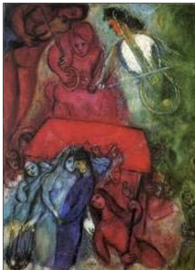
Fig. 28. The Wedding , 1944. Oil on canvas, 99/74 cm. Private collection