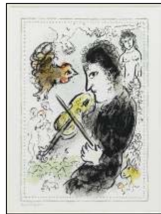
Fig. 6. A Violinist and a Cock , 1982. Paper, Lithography, 66/50 cm. Nice, National Museum of Marc Chagall

Chagall's violinists possess the art of levitation and easily “hang” above the roofs of the houses, devotedly rocketing to the moon and clouds - sometimes together with their chair - as in Blue Violinist , or perched on the foundations of world turned upside-down, as in A Violinist and an Inverted World . In the sky, birds - the most creative and sweet-voiced representatives of the natural world - become the musicians' companions. Olga Burenina associates the effect of the “floating body” with the development of new forms of artistic vision at the beginning of the 20 th century, connected with polymodality and paradoxicality of perception. Viewing the image of the violinist raised into the sky from the panel picture, she observes that music, penetrating into space,