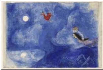
Fig. 47. Aleko and Zemfira in the Moonlight. A scenery design the "Aleko" ballet, 1942. Paper, gouache, pencil, 38.4 x 57.2 cm. Private collection

drama 47 are not reflected at all in Chagall's works. This may be connected with the musical preferences of the painter, whose favourite composer was W. A. Mozart, or to his self-identification as Russian-French with Jewish origins.