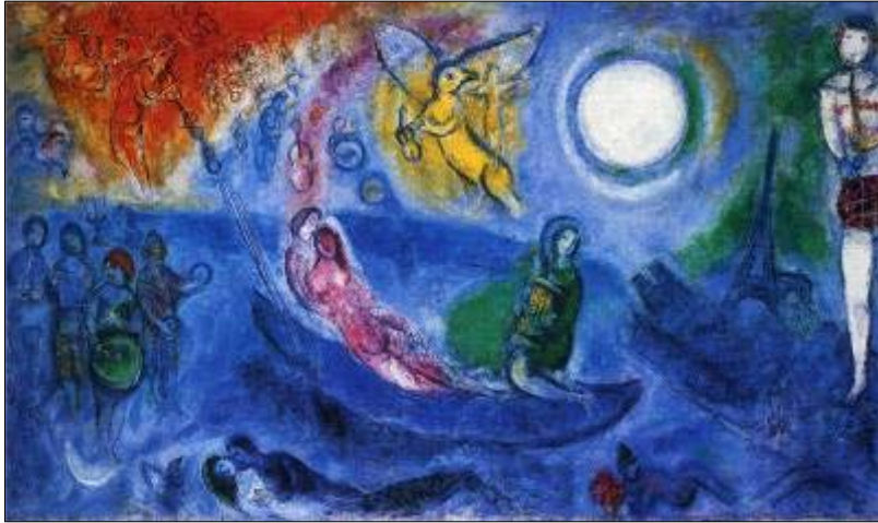
Fig. 39. A Concert , 1957. Oil on canvas, 140/239.5 cm. Private collection

among the players of the Concert , along with a man-cello). Old and modern instruments - bell, lyre and saxophone - are also combined.