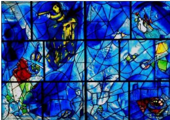
Fig. 51. Windows of America . First and second stained glass panels, 1977. Chicago, Arts Institute

As in the series of panels for the State Jewish Chamber Theatre, Chagall uses cubist devices creatively, allegorically presenting music, dance and theatre on separate panels. 50 Another three panels are devoted to the fine art, the Declaration of Independence of the USA and symbols of American national identity (national emblem, the Statue of Liberty against the background of silhouettes of American architecture). Amongst these, appear the outlines of Vitebsk streets, the Eiffel Tower, silhouettes of lovers, animals and fish also emerge. Such return in the later life line to the images of distant past in another context, makes the painter's artistic development concentric, thus summarising his search for a world outlook.