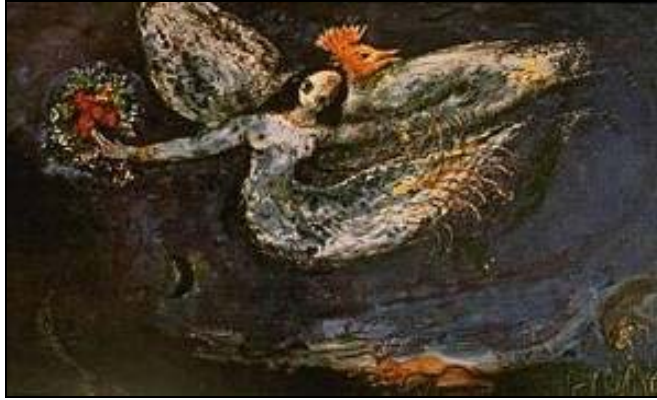
Fig. 50. The Firebird . Decoration for overture of the Firebird ballet by I. Stravinsky, 1945

As in the series of panels for the State Jewish Chamber Theatre, Chagall uses cubist devices creatively, allegorically presenting music, dance and theatre on separate panels. 50 Another three panels are devoted to the fine art, the Declaration of Independence of the USA and symbols of American national identity (national emblem, the Statue of Liberty against the background of silhouettes of American architecture). Amongst these, appear the outlines of Vitebsk streets, the Eiffel Tower, silhouettes of lovers, animals and fish also emerge. Such return in the later life line to the images of distant past in another context, makes the painter's artistic development concentric, thus summarising his search for a world outlook.