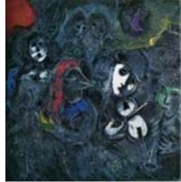
Fig. 38. Clowns in the Night , 1957. Oil on canvas, 95/95 cm. Private collection

The picture Clowns in the Night ( fig. 38 ), with its mystical colouring, is the exception. However, the grief of the play-actors is ambivalent and could pass into abandoned hilarity at any moment. In this sense, unavoidable parallels with Schoenberg’s melodrama Pierrot Lunaire , cultic in the 20 th century, imbue the picture with polysemy. Dense darkness, from which the faces of playing and singing comedians emerge, makes the performed music illusive, unreal, balancing the dynamics up to a soundless state. This is the music of calm and silence, the music of dream, which will dissolve into the night without trace along with the clowns.