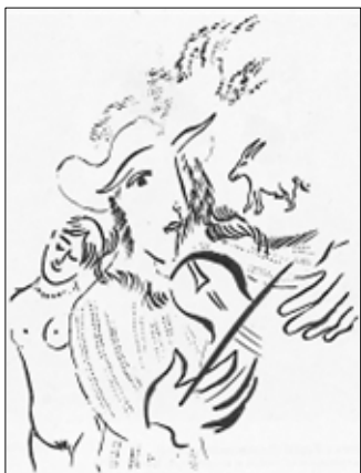
Fig. 9. A Violinist at Night , 1939. Paper, pen, 43.2/28 cm. Private collection