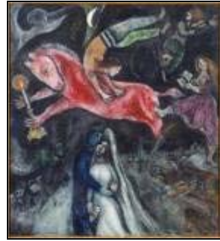
Fig. 35. A Red Horse , 1938-1944. Oil on canvas. Paris, Centre of George Pompidu