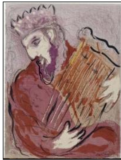
Fig. 21. David with his Harp , 1956. Lithograph, paper, 36/26.5 cm. Nice, National Museum of Marc Chagall

The development of this idea can be observed in the etching David sings, accompanying himself with the harp before Saul, and relieves his sufferings , resurrecting a well-known Bible story about poor Saul, subject to sudden outbursts of melancholy and aggression which could be alleviated only by music ( fig. 20 ). The Psalmist David is one of the Chagall’s favourite figures; the artist created numerous pictures of the second king of Israel in his early and middle years in his Bible lithographs and pictures ( David with his Harp , fig. 21 , A Tower of Tsar David , fig. 22 ). Everywhere the hero is depicted with