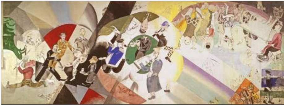
Fig. 41. Introduction to the Jewish National Theatre , 1920. Canvas, tempera, gouache, 284/787 cm. Moscow, State Tretyakov Gallery

acrobats and actors with musical instruments. Chagall's innovative creativity is manifested in the way his geometrical plans produce their own rhythm, which accompanies the movement of figures and explodes, breaking the contours, creating the illusion of a ragged, syncopated rhythm. 39 Taken as a whole, the panel presents the theatre as a world, and the world as theatre, penetrated by light and simultaneously conveying the chaotic nature of existence.