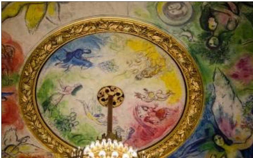
Fig. 45. Dome lamp painting. Central circle. Paris, Grand Opera

perceived as an expression of the endless triumph of genius over frail material. The wide coverage of different styles, national schools and historical periods in the fresco testifies to the artistic universalism of Chagall's concept.