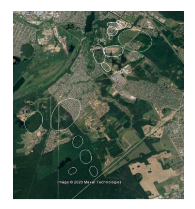
Figure 1. Ring structures of positive and negative type with watering and swamping in the Mirny-Boriskovo are and ZhKSolovininayaRoscha and Fairy Forest

The most visual comparison of the city territory with active ring structures is reflected through the superposition of the data of the selected objects on the scheme of the existing functional zoning of the city. In the context of this article, the distribution of functional zones in areas with a large number of active hydrogen degassing structures was analyzed - in the Volga and Soviet districts of the city.