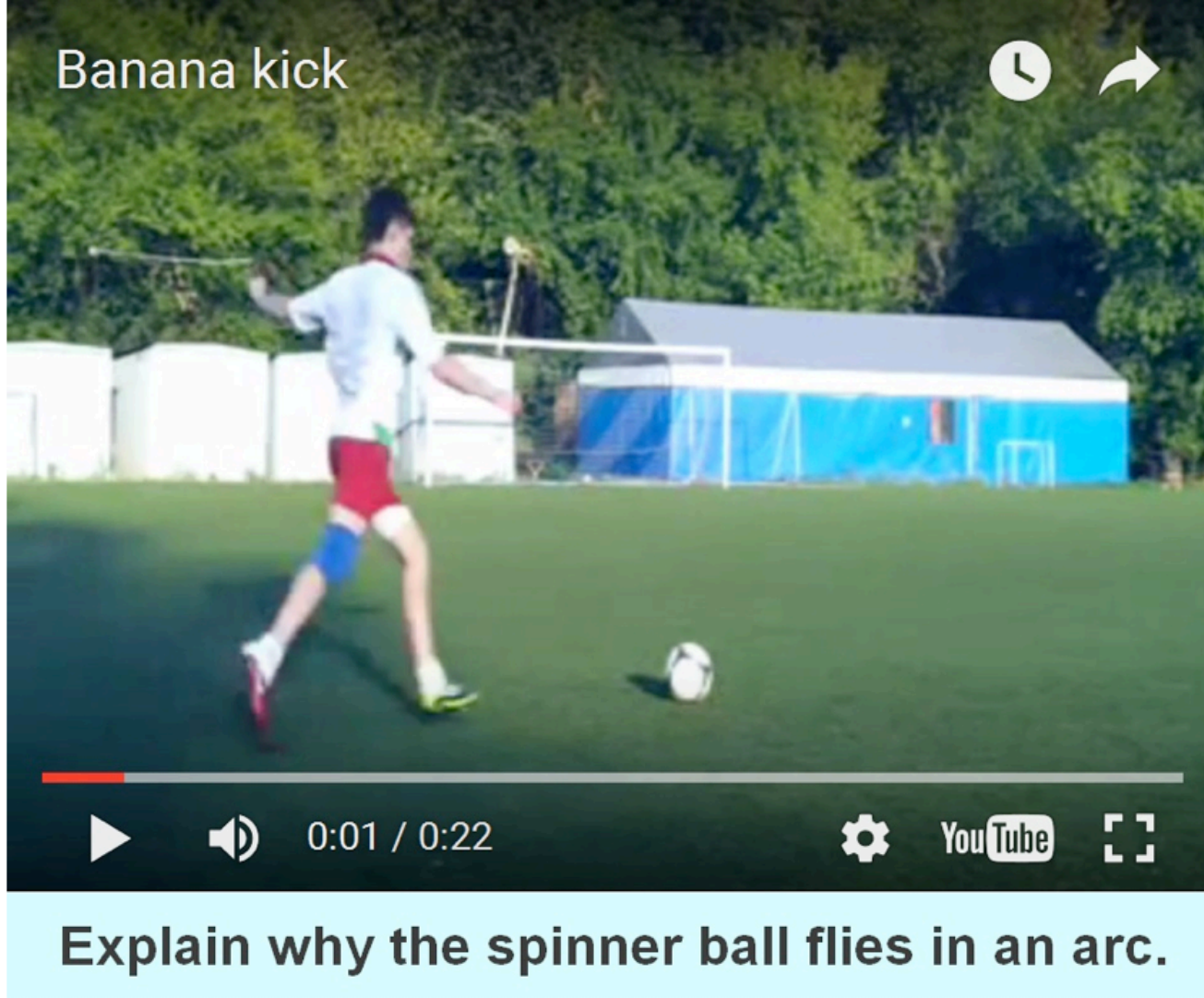
Figure 3. Example of "Essay" type test task

Every particular test is formed from the bank of test items created by the teacher. The test can be set in a learning mode and a control mode.