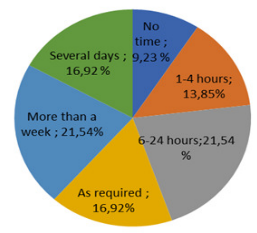
Fig. 3. Possible time without Internet access.

Addiction to the Network can be estimated not only by the time spent online, but by the attitude of people to what is happening in the Internet. Thus, 20 % of respondents noted that the number of approving "likes" bellow their publications matters to them. And 37 % of students admitted that they follow the news and change gadgets after the release of the new model.