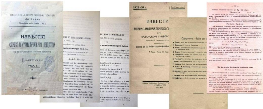
Fig. 2. Articles in one issue can be presented in Russian, French, German, English or Italian. Articles in Russian are accompanied by a summary in one of the listed European languages.

One collection may contain articles in several languages; at the same time, for articles in Russian, a mandatory requirement of the editors was the inclusion of a summary in one of the following languages: English, German, French or Italian (see Fig. 2).