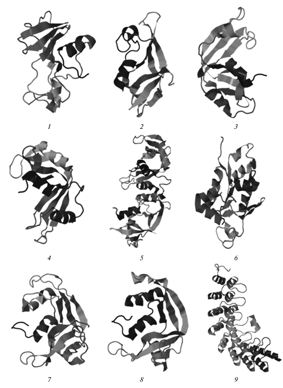
Fig. 1. Three-dimensional structures of antiviral RNases of various origin obtained using the Jmol program and the protein database (www.jmol.org and www.pdb.org). 1. binase, 2. onconase, 3. RNase from Rana catesbeiana, 4. bovine pancreatic RNase, 5. BS-RNase, 6. MCPIP1, 7. ECP, 8. EDN, and 9. RNase L.

goadenylate synthetase polymerizing ATP with formation of RNase L activator, 2',5'-oligoadenylate, of the general formula ppp2',5'-A<sub>n</sub>, where n = 2-10 adenylate residues. RNase L mechanism of action is well studied, i.e., the active form of RNase L forms a dimer