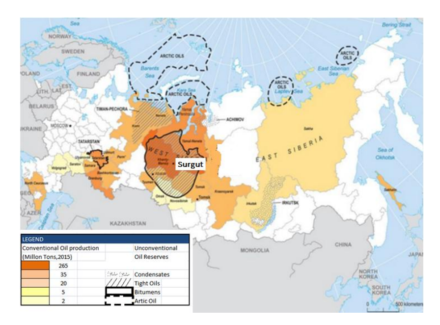
Fig.1Geographical location of Surgut, Siberia region-Russian Federation, coordinates 61°21′ N, 73°26′ E. 2.2 Microbiological isolation

A sample of soil polluted with crude oil was taken from an oil field in Surgut, in the region of Siberia–Russian federation (figure 1). The sample was taken at a depth of 5-7 cm, with the aid of a sterile spade which permits getting rid of any excess of humidity from the sample.