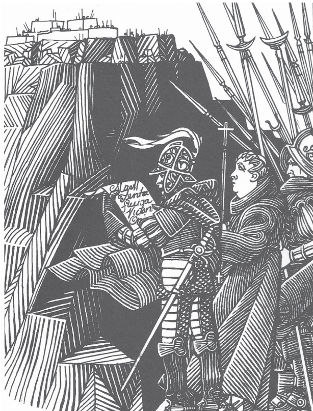
Reading the Acts of Vassalage and Obedience at Acoma.

was based on the assumption that the Pope, acting on behalf of Christ, had authority over all kingdoms of the Earth. Accordingly, the Pope could delegate to specific rulers both spiritual and secular authority over people who were not Christians. Acting on this premise, the Requerimiento would be read to a group of Indians at the time the Spanish encountered them. If the encounter was friendly, the Spanish would not attack. If, however, the Spanish encountered resistance, the Requerimiento had served as formal notice of the conquistadores' divine authority – notwithstanding the fact that the document was read in a language unknown to the Indians. Thus the Requerimiento served as justification by the Spanish for the use of force and the appropriation of property. 1